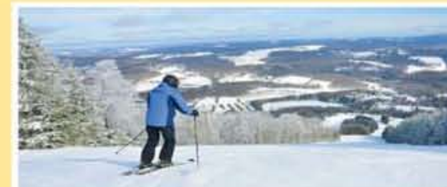
ELK MOUNTAIN-Skiing at its best.