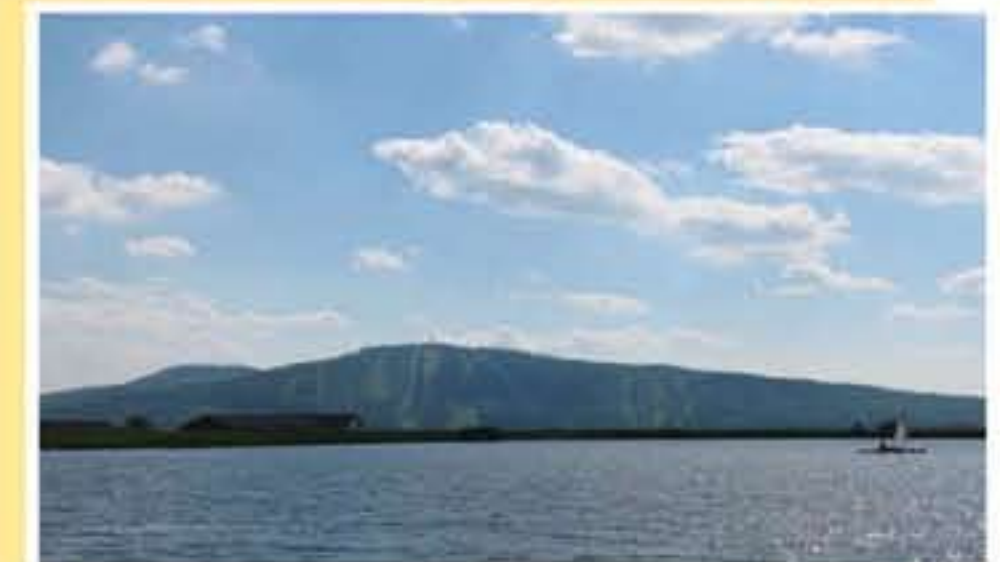
ELK MOUNTAIN IN THE SUMMER.

12. Greater Carbondale Chamber of Commerce 27 North Main Street Carbondale, PA 18401 570-282-1690 info@carbondalechamber.org www.carbondalechamber.org